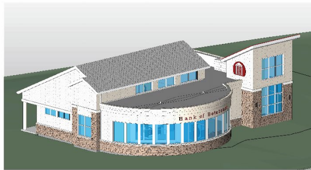
Rocky Mount Office Rendering